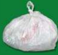
Bagged plastic bags, shrink & stretch wrap