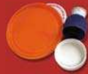
Lids, caps tops