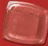
Plastic food trays