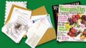
Mail, magazines, mixed paper & catalogs