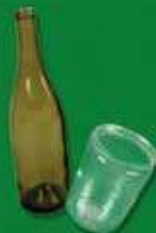
Glass bottles & jars