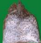
Strip-cut shredded paper (in see-thru bag)