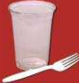
Plastic cups & utensils