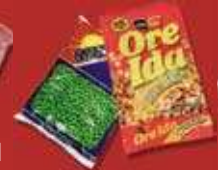
Frozen food bags