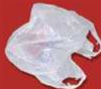
Loose plastic bags