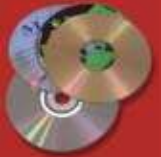
CDs & CD cases