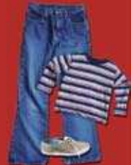
Clothing, textiles shoes