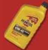
Toxic product containers