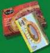
Paper or frozen food boxes