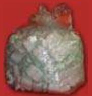
Styrofoam peanuts (prevent littering - put in bag)