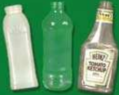
Plastic bottles (all colors)