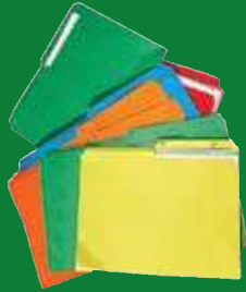
Files & file folders