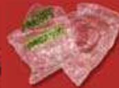
Plastic food bags