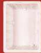
Plastic food boxes