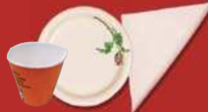
Paper plates, cups & napkins (can go in yard waste cart)