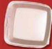
Foam take-out containers