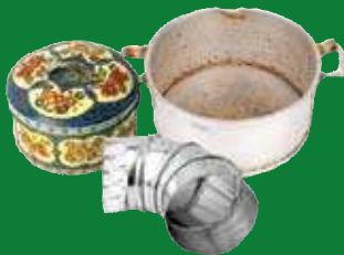
Ferrous metals maximum size (16"x16"x12")